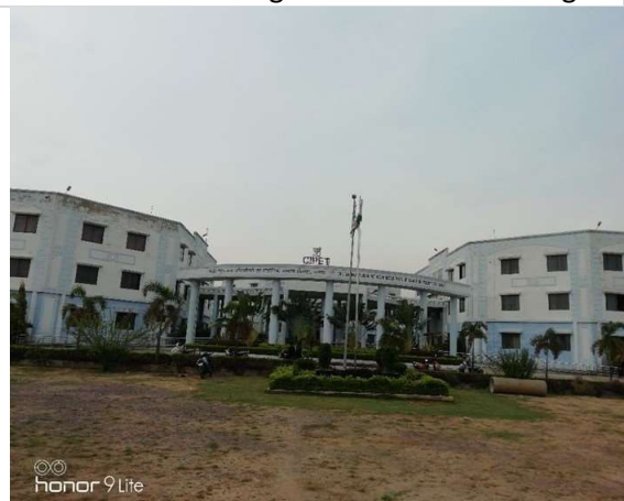
Education hub Syahimudi - Built at a cost of Rs. 240 crore this infrastructure is being used partially. It is built by Chhattisgarh Housing Development Board. There are four buildings – 1 CIPET, two primary schools and one prayas residential school.