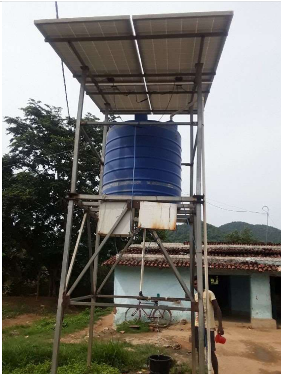
Solar Drinking Water, Panchpandav, Devdaria, Kisko