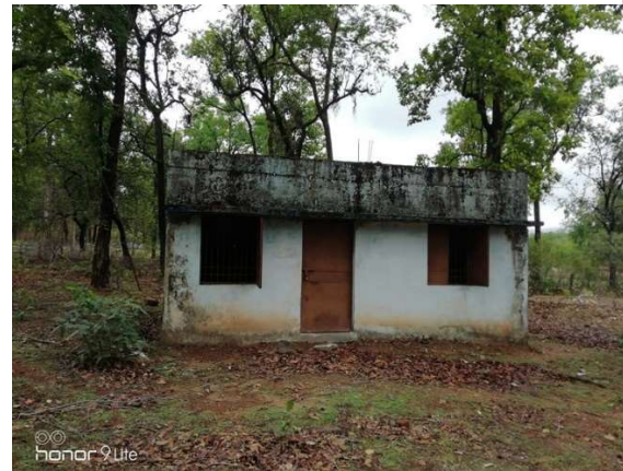
Elephant Assistance Centre in Village Futhamuda, Bela, Korba stands by itself