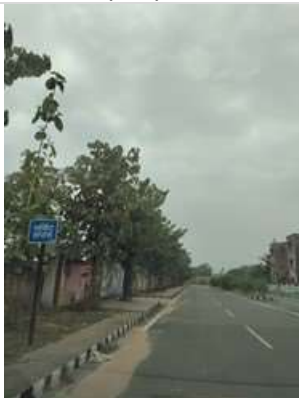
For Whom? Circuit house is usually not visited by citizens. Moreover trees are concretised.