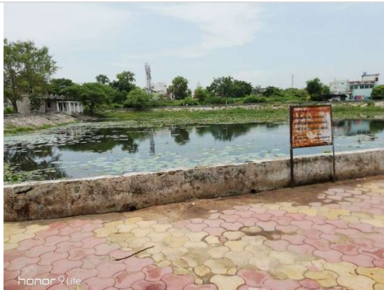
Pondibahar talab conservation work, Pondibahar, Korba - None uses it. Quality of work seems bad