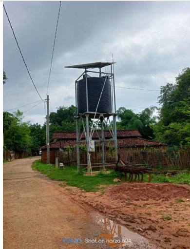
Solar based Drinking water supply in Village & Panchayat Pithachor (Bonaigarh) is lying defunct, requires maintenance