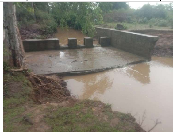
This stop dam work in Badekachhar nala of Panchayat Parsada in Pali Block was erected without taking suggestions from local community