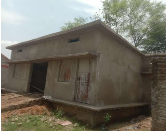
Fair price shop in Gram Panchayat Polmi of Pali Block - Built at a cost of Rs. 15 Lakh this very useful project has been left incomplete with no reasons known to the public