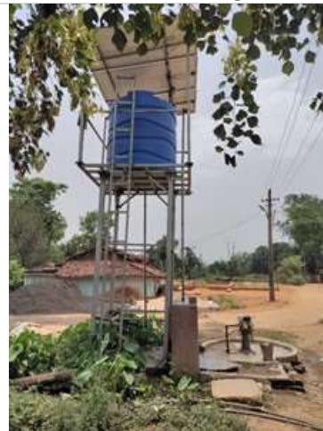
Working but O&M improper. (Beyand Village of Kulhi Panchayat)