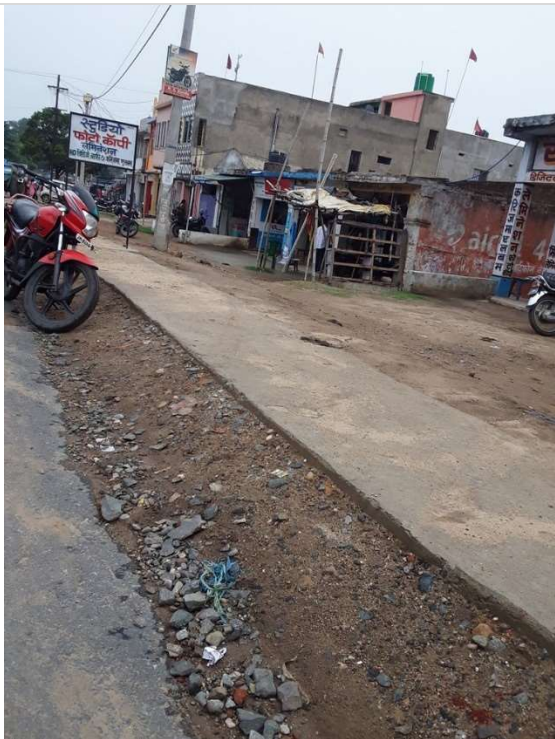
Inappropriate Drain Construction – Built in Swang South of Gomia Block, Bokaro.