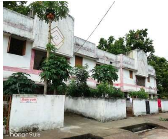
Residential Building, Lemru, Korba at Rs. 39,40,000