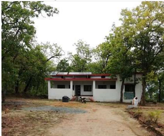
Environment Awareness Centre looks deserted, Gahaniya Village, Bela Panchayat, Korba. Not even a board is there