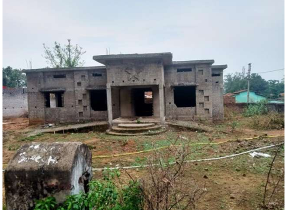
Panchayat sachivalay construction left incomplete in Village and Panchayat Kudmura. It is being built at a cost of Rs. 16.45 Lakh and now with rising inflation the cost will increase.