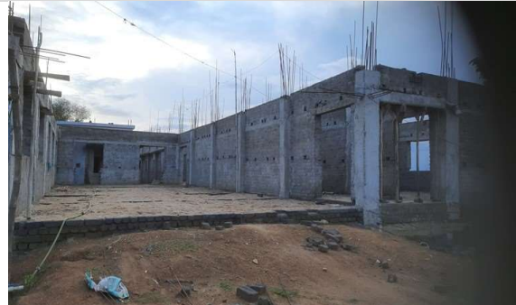
Barhaband High school is being built in Gauchan land in 20 decimal area. Whether it affects rights of people and will it serve its purpose in small place is a question. Participation seems to be a far cry!