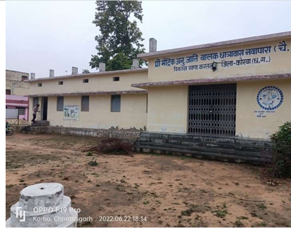
New Boys Hostel in Nawapara (Rampur): If a solar light is provided in this hostel, it will help students to utilise it during evening to night time for studying.