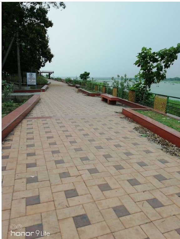
Riverfront Darri Barrage: Total cost of three projects is Rs. 1.88 Crore? It looks deserted and is not of relevance to mine affected communities.