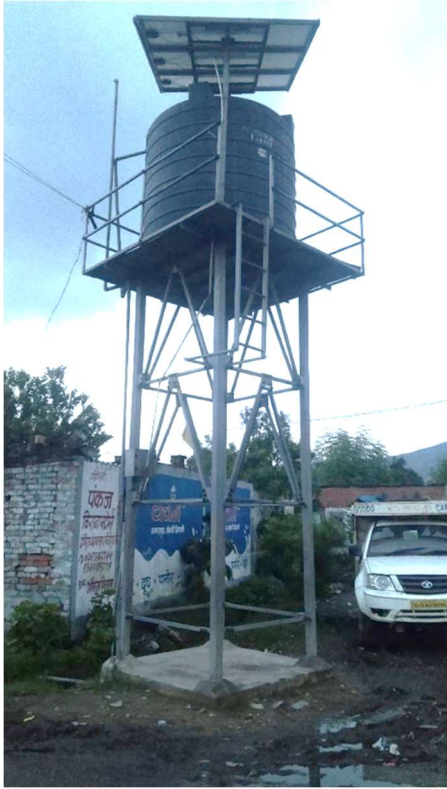
This solar drinking water project in Chiraipani Village and Panchayat face difficulty in fetching water due to frequent operational problems. Many workers working in nearby factories depend on it and require urgent attention on this