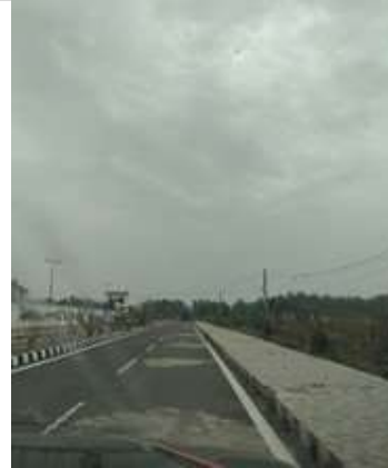
Uncommon Cause - Footpaths with no takers!