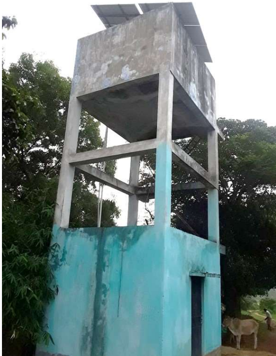
Water Supply Scheme Bagad (Jamun Toli) Bagad Kisko