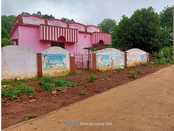
Kiri Village of Mahulpada Panchayat (Lahunipada Block), Anganwadi Centre Work – Village needs attention on all works