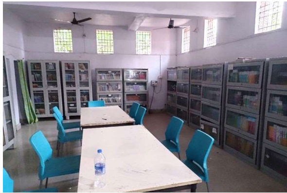
District Library Chatra: Built at a cost of Rs. 75 Lakh. New books are lacking. No regular newspaper. People working have not received salary for last 16 months.