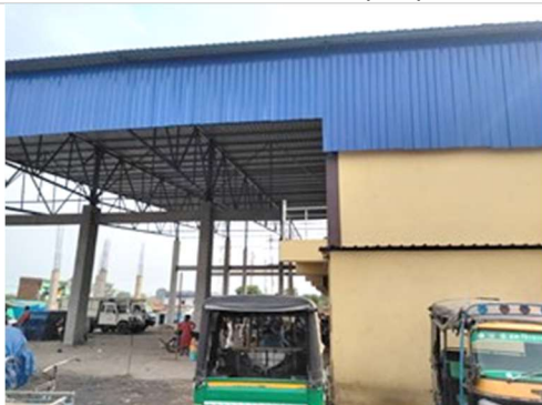
Development of Gola Market of Gola Block which is a commercial project at a estimated cost of Rs. 5 Crore. Whether such projects be developed under DMF? Will the affected get shops in this market?