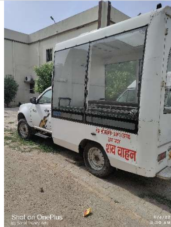
Cradle to Grave! Infrastructure is such a wide term to include everything under its stride.