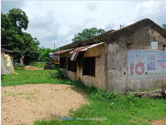
Taldihi Upper Primary School – No work has been done, S Bolang of Bonaigarh Block