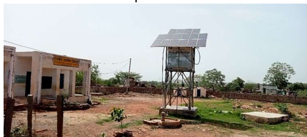
This scheme in Dhaneshwar Village of Talera block performs poorly as water supply is low