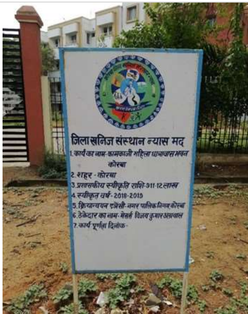
Working women hostel, Korba City