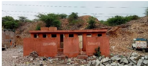
No water facility in this toilet complex in Budhpura mines