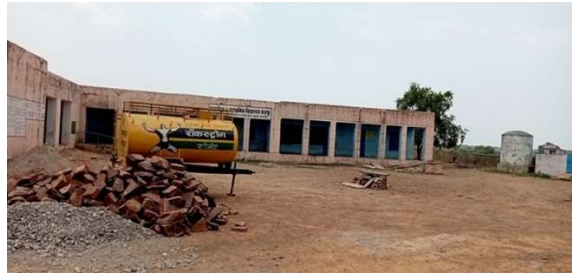
This school of Badfu in Ganeshpura Panchayat of Talera Block is awaiting completion from last 4 years