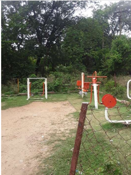
Open Gym in Sector - 2, Bokaro