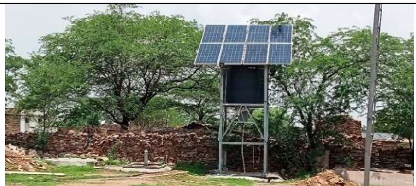
Built at a cost of Rs. 3 lakh, It is defunct as the bore doesn't have water. This project in Guwar, Loicha Panchayat in Bundi is lying defunct. People also complain about small size of water tank.