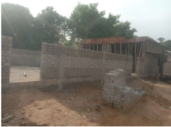
Gram Panchayat Kerajharia awaits completion of various construction works in Swami Aatmanand School of Excellence - Under construction, must be completed fast to provide benefits to the people of the areas.