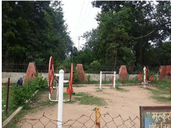
Open Gym in Sector - 5, Bokaro Jharkhand Audit has already pointed to these open gyms as incompatible activities done from DMFT fund.