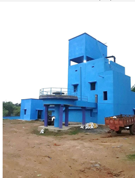
Pumping station, Swang Project (see next page)