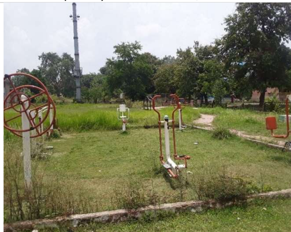
Open Gym, Sector 4D, Bokaro