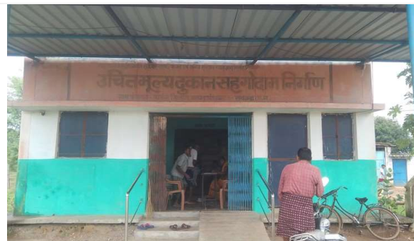
This PDS Godown is far from most of the habitations of Village Bayang of Raigarh Block destined to benefit more than 2000 people

Construction of Stage at Navodaya Vidyalaya Bhupdevpur (Block Kharsia) Raigarh was proposed in 2018 at Rs. 5.42 lakh. On visiting the village, it was not found to exist on ground.