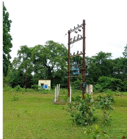
Kumundi lift irrigation project of Mahulpada Panchayat is Defunct. Repair is required