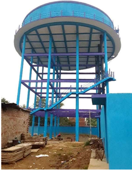
Swang Drinking water supply scheme at a cost of Rs. 9 Crore in Swang South Panchayat. 4-5 villages will get benefit from the scheme (Swang, Kenduakocha, Pipradih, Karmatia)