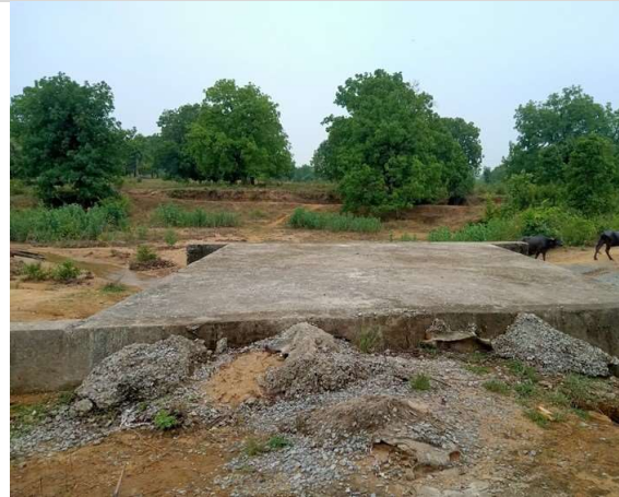
Delayed/Left Incomplete – The construction work for road and culvert project in Village Jilga