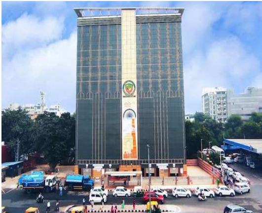
The first-of-its-kind facility in the national capital comprises four 39.5 metre high towers, where 136 cars including 32 SUVs can be parked. Built on an 878 square metre (sqm) plot, the project cost is Rs 18.20 crore. (below)