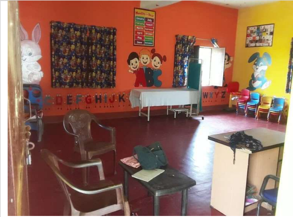
Model Anganwadi Centre in Tandwa looks impressive. But there is no water and electricity connection pointing to inter department coordination and provision of essentials like water and sanitation