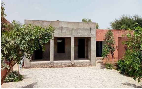
This school in Guda, Rajpura Panchayat, Talera block started in 2020 is left incomplete due to less budget provision and change of contractor