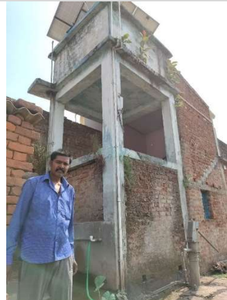
Difficult to access - a water tank in Labga Village, Patratu, Ramgarh