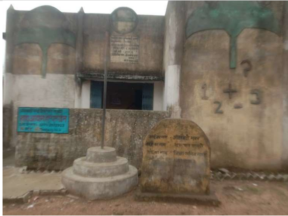
Anganwadi (Village Diprapada, Parsada) built in 2017-18, the photo speaks of maintenance!