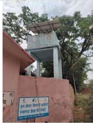
People say it should be made accessible to village during off school hours, it will improve its viability. (Village Rundai, Panchayat Bariyatu, District Ramgarh)