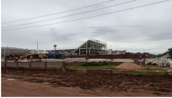
Built at a cost of Rs. 1368.25 million, this International hockey stadium is being built in Sundergarh's Rourkela Town