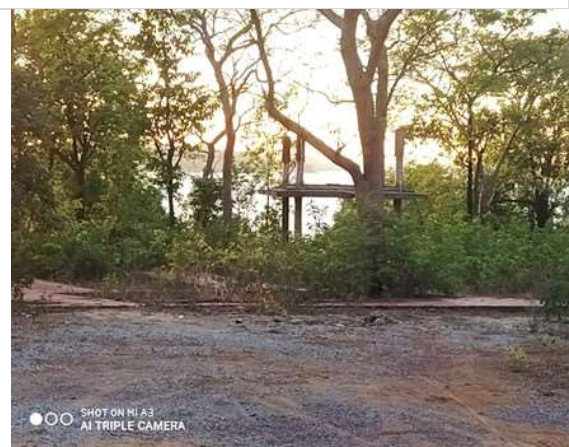
Plantation cum Garden, Satrenga, Korba. This is a tourist attraction and not an affected area by mining. Built at a cost of Rs. 20L