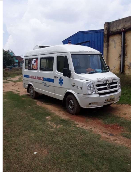
An ambulance in Tandwa block of Chatra