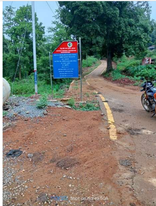
Construction Of road & CD work from Tentulikhunti to Uskela (Lahunipada) is incomplete.