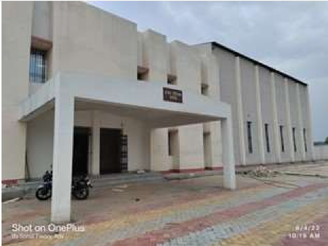
Indoor Stadium built in Chatarmandu Village and Panchayat at a cost of Rs. 3 Crore. How projects are prioritised by the Trust is questionable?