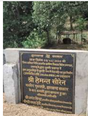
A Bridge over River connecting Jamuabeda to Kulhi