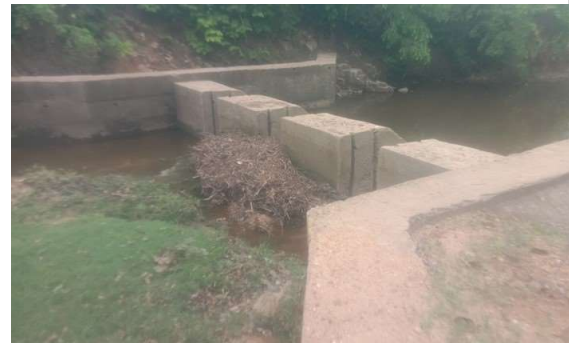
No benefit to the people and the quality is also bad? Stop Dam built across Kaccharpara Nallah, Village Dumar Kacchar, Pali