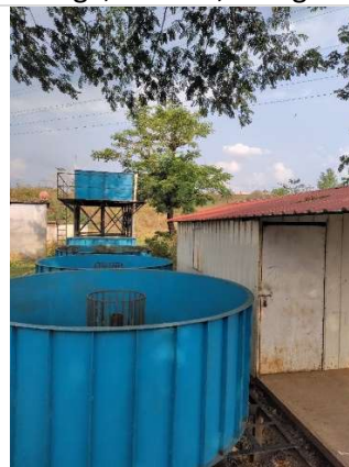
Built at a cost of 1.74 Crore, the fishery cages aren't working.