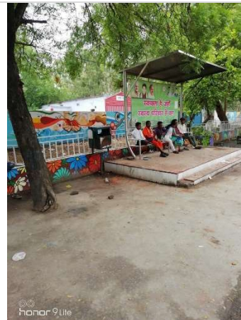
Around 25 such bus stops costing Rs. 7.5 Lakh each have been built by Municipal Corporation Korba costing Rs. 1.87 crore cumulatively. It can seat only 6 six people. This photo is of ITI Tansen Chowk bus stop