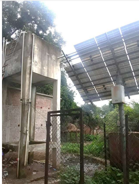
Solar Based Water Supply, Kocha, Kharki, Kisko – Not Working properly