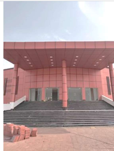
Town Hall in Ramgarh under construction in Chatar Village at Rs. 5 Crore cost.