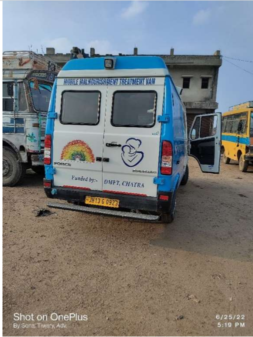
Makes awareness about malnourishment. Conduct survey and organise camps for malnourishment in the chatra. Especially in PVTG area.