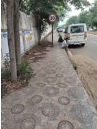
Beautification of public places with DMFT fund! Is this really the priority need of affected people.