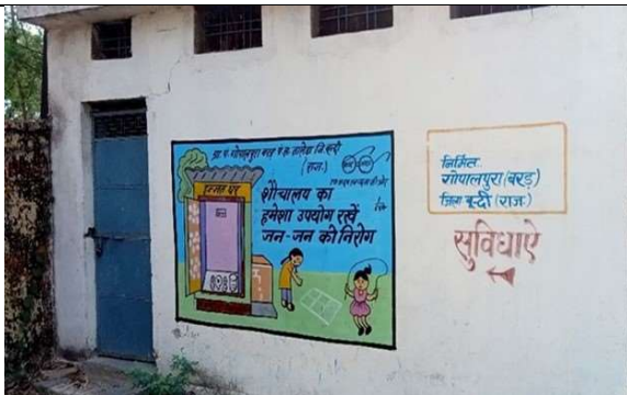
Roof leaks during rains of this facility in Gopalpura Panchayat