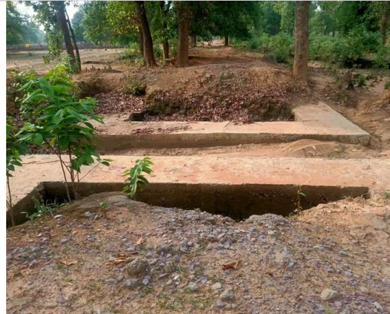
Culvert awaits completion. Work is incompleted in Ludo Khete village of Chachiya Panchayat.