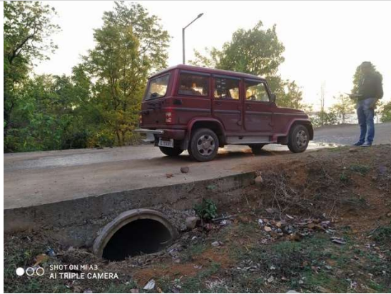
A road-culvert built in Satrenga of Korba block. This road is largely used by tourists and not an affected area by mining. Built at a cost of Rs. 20L