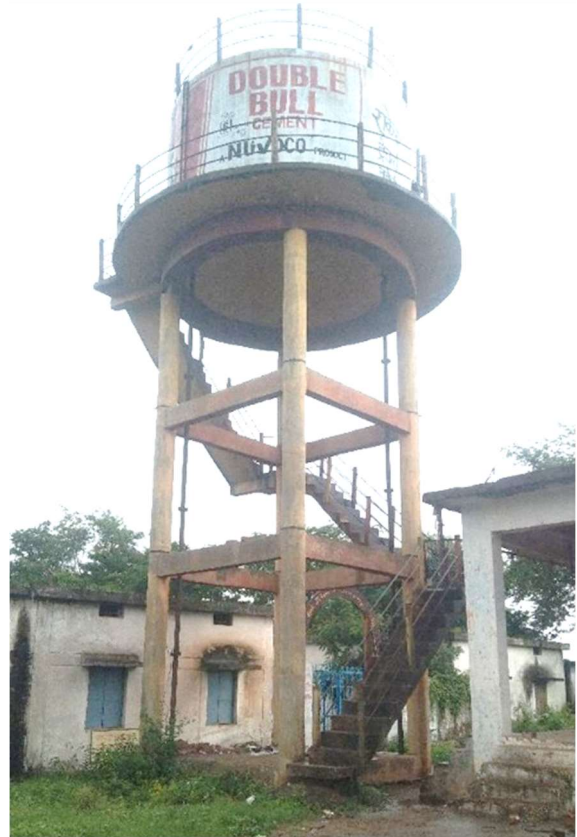
Pipeline burst is common for this water tank, iron concentration is also there in water. Good quality pipe replacement is required for this utility in Village Nandeli, Raigarh

Construction of Stage at Navodaya Vidyalaya Bhupdevpur (Block Kharsia) Raigarh was proposed in 2018 at Rs. 5.42 lakh. On visiting the village, it was not found to exist on ground.