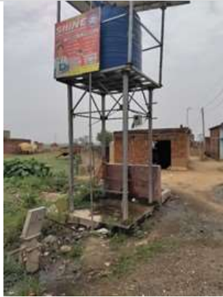
This could have been built in better way. If public consultation was held, we may have suggested. Village and Panchayat Bariyatu