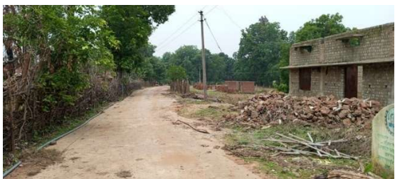
This Samudayik bhawan in Village Mhuahar, Panchayat Kerakachhar is delayed