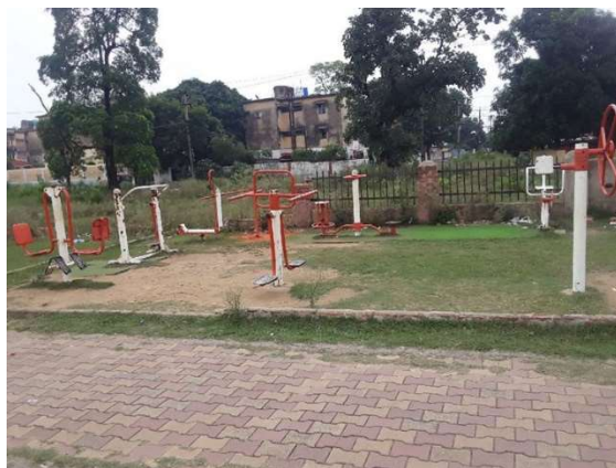
Open Gym, Sector 4F, Bokaro