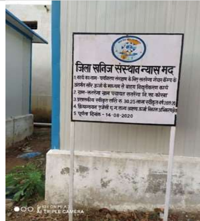
The name itself suggest that this facility is for Nature Camp (Satrenga, Korba) which is approximately 35 kms from the mining area in Korba. This has costed Rs. 30.85 Lakh