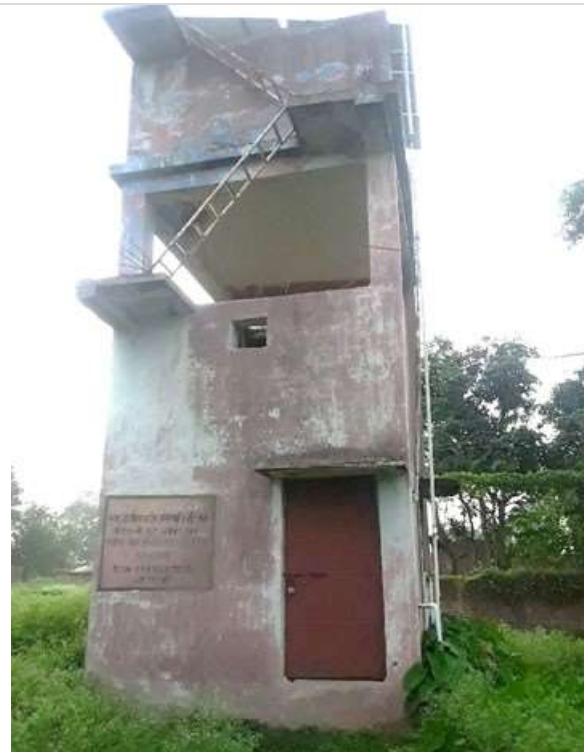
Chandlaso WS Scheme (Kudu Block of Lohardaga District) is not working for last 18 months due to faulty submersible pump. It must be restarted as it is useful for the people