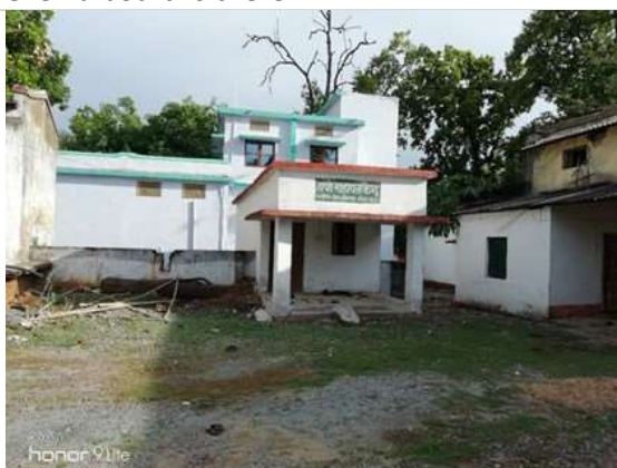
Elephant Assistance Centre (Lemru, Korba) built at a cost of Rs. 5L by forest department in an area not affected by mining. It looks deserted.