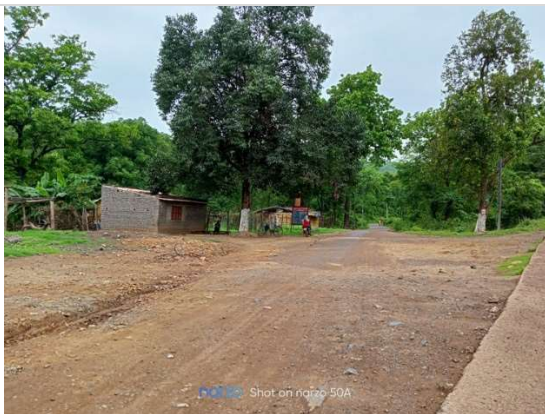
Construction of Jamudihi Road to Barsuan road, Gaganaposh of Chordhara Panchayat (Koida). It has damaged fast and requires attention.