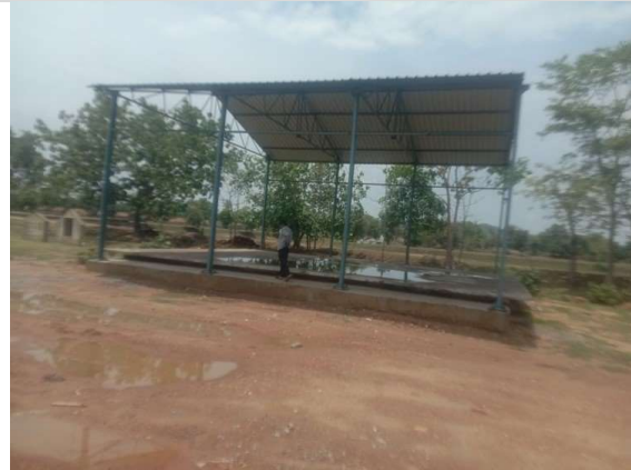
A place to collect paddy produce in Gram Panchayat Nirdhi (Pali Block) has wet floor after rains. The design issue leads to leakage.