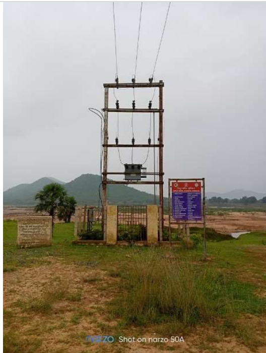
Community lift irrigation project San gugua -2 in Bonaigarh Block damaged. Repair required