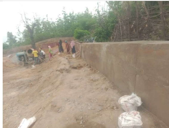
Returning wall (Shiradi Jhorki Pond) in Village and Panchayat Saraipali in Block Pali is delayed.