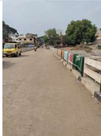
Its beneficial but its drainage is such that water enters Panchayat Bhavan. Something must be done. (Village and Panchayat Gola, District Ramgarh)