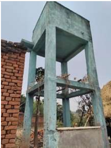
Its 2022. Built in 2019, this project remains defunct. No Electricity supply. (Kulhi Borrakocha, Dulmi, Ramgarh)