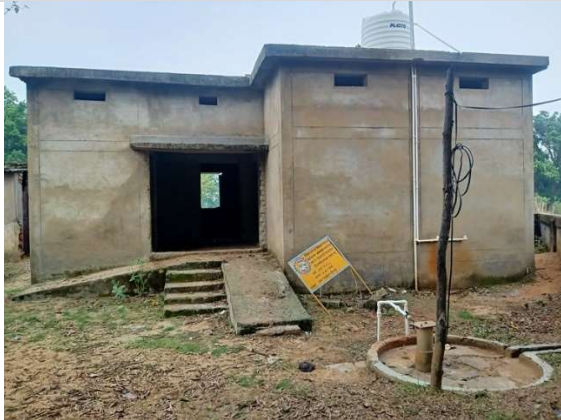
Delayed – This Anganbadi in village Jilga. It's a 2017-18 project but it is still awaiting completion, people pray it is built fast