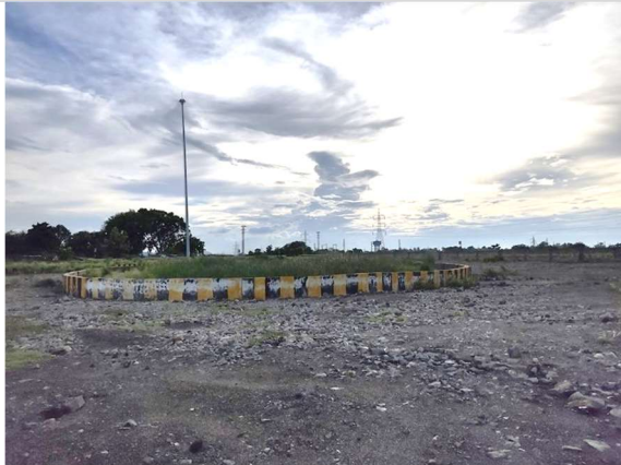
Construction of Truck Terminal/Parking Near Tarkera(Rourkela) Grid Left Side Of NH-143: Current land is coming under the surrender land (Rourkela Steel Plant surrendered to State Government) which is subjudice under NCST commission