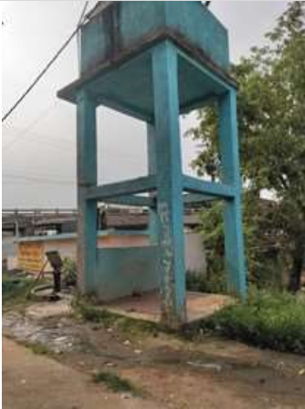
This solar water project in Gola village of Kumahdaga Panchayat is defunct. No tap is installed. People want a resolution to it, to make it work for the people.