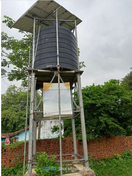
Solar energy based dual pump in Village & Panchayat Kudheikala, Lahunipara. Pump isn't working. Repair required