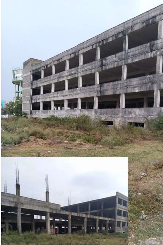
Left Incomplete - This scheme is incomplete and closed from many years. Built at a massive cost of Rs. 17 Crore, this asset created by the authorities is of no use for a city like Korba. (lef)