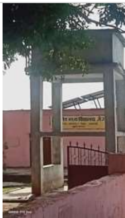
Gagada Middle School Water tank works well for students