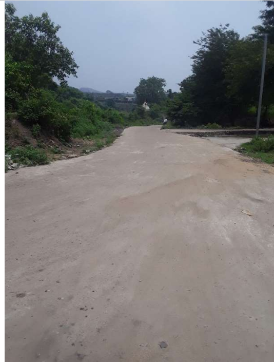
PCC Road from Jodia Bridge: The quality of this road seems compromised in Jaridih East of Bermo Block, Bokaro