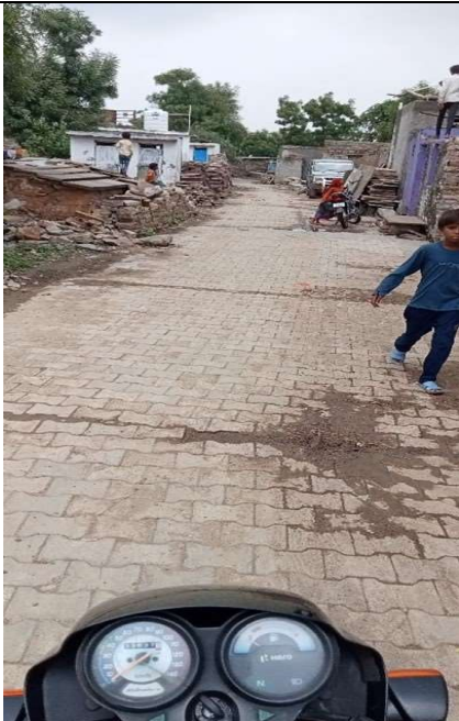
Interlocking tiles, Budhpura (2 years old) In this village, people mention that there is a requirement of road in Majit Colony and PM Awas is delayed and there is water problem too.