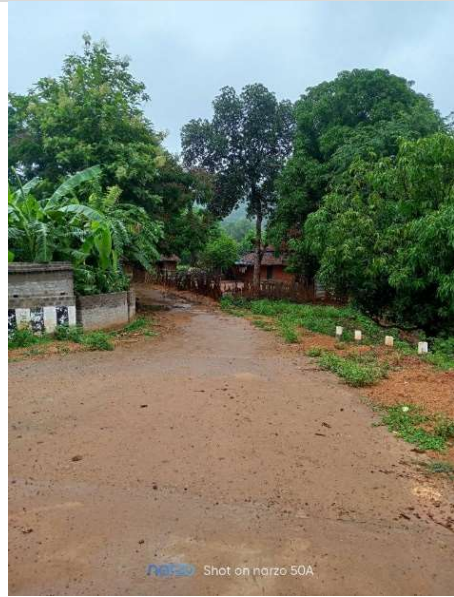
Nuatntra school to Kastutola road work will benefit 2 villages including Tantra & Kastutola of Chordhara Panchayat (Koida). Road quality should be maintained