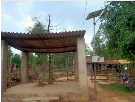
Street Light in Chachiya - The battery is defunct so the purpose for which it was installed is not achieved. Replacement battery needed