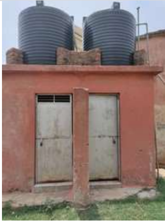
Toilets remain locked, Favours asked to let get some water (Kulhi, Ramgarh)