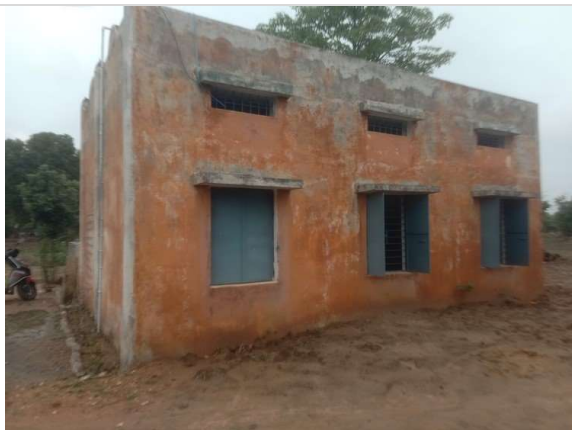
Anganwadi in Mauharbhatha of Parsada Panchayat of Pali block. It seems site selection was not discussed during project formulation