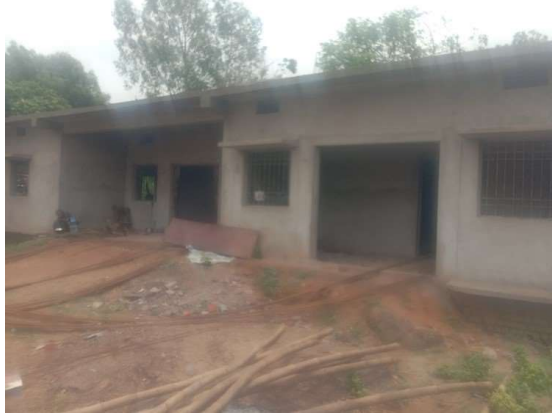
Left Incomplete: PDS Godown work awaits completion in Village & Panchayat Renki (Pali)