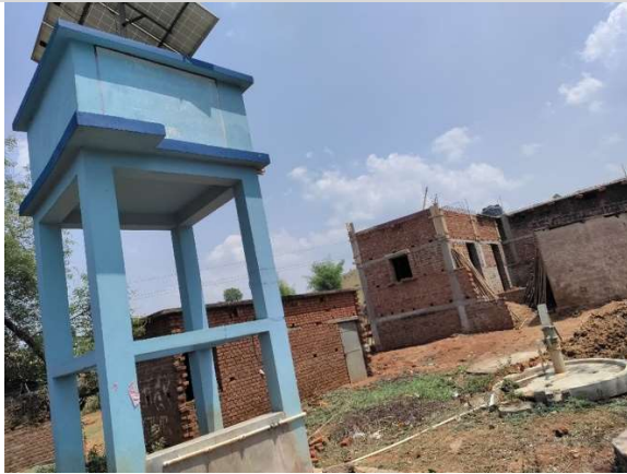
Built in 2017, this tank in village Talatand remains defunct